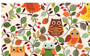
1518-Q 1/4 yd