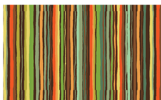
1523-V 1 1/4 yds (includes binding)