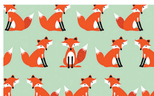
1519-T 1 3/4 yds