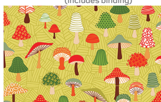
1521-Y 1/3 yd