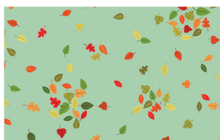
1522-T 4 yds (includes backing)