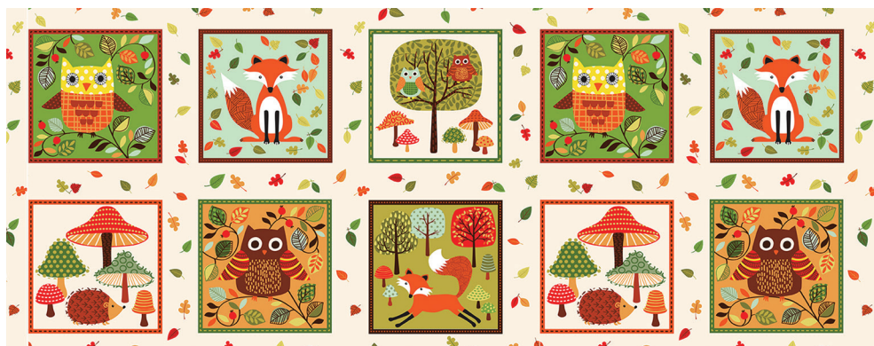
1517-1 1 yd

Blend with fabrics from the The Color Collection by Andover Fabrics.