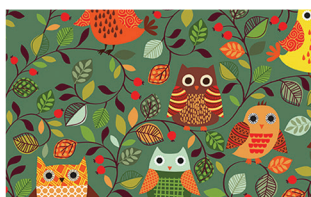
1518-T 1/3 yd