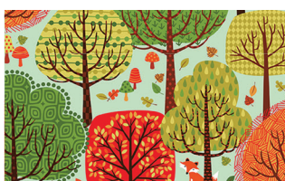
1520-1 1/3 yd